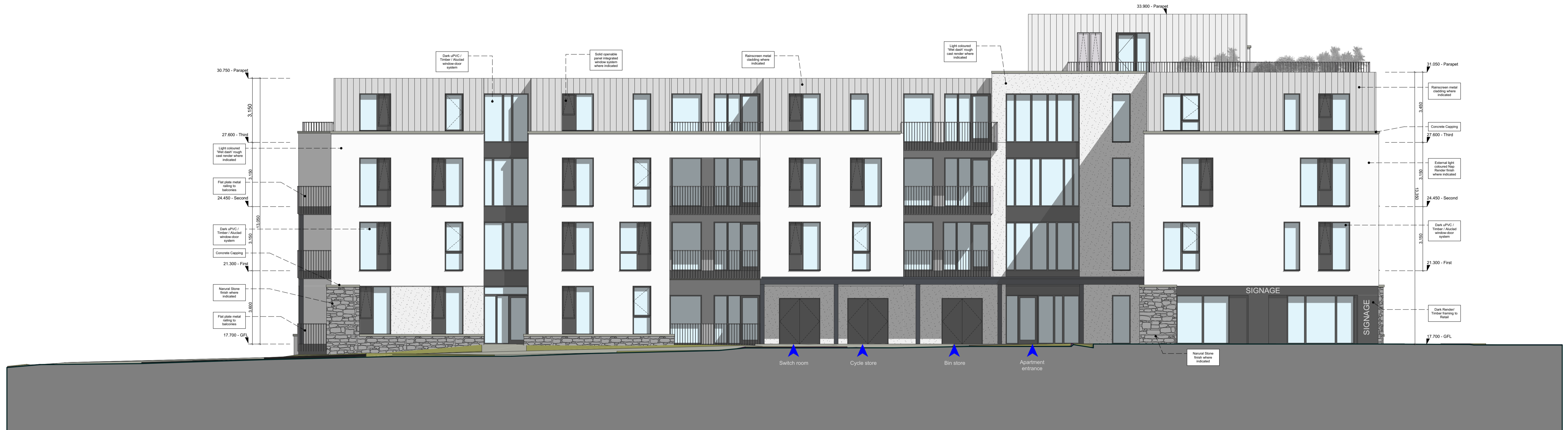
2 West Elevation Scale 1:100 @ A1 / 1:200 @ A3

REFER TO ARCHITECT'S SITE LAYOUT PLAN 3004 FOR NORTH ORIENTATIONS. THIS DRAWING TO BE READ IN CONJUNCTION WITH ARCHITECT'S DRAWINGS, CONSULTANT ENGINEER'S DRAWINGS AND SPECIFICATIONS.