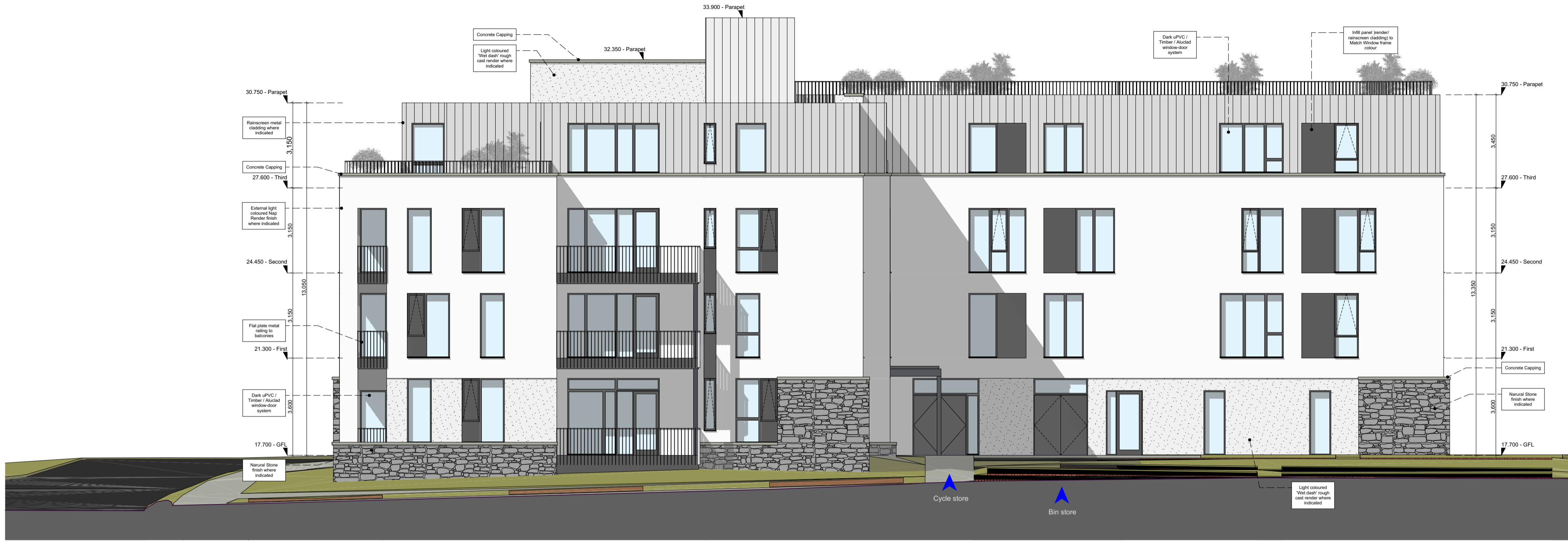
1 North Elevation Scale 1:100 @ A1 / 1:200 @ A3